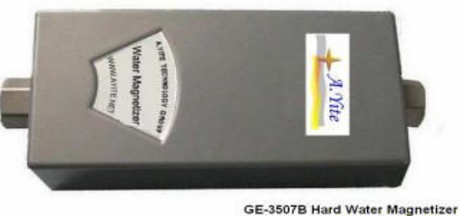
GE-3507B Hard Water Magnetizer A.YITE TECHNOLOGY

The Magnetizer Residential Hard Water Conditioner has been proven to produce chemical free, salt free, and healthy answer to your hard water problems. The Magnetizer accomplishes this by magnetically dissolving the existing